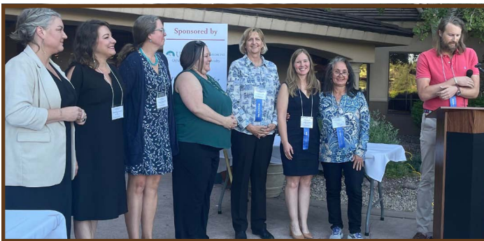
Officers & COD Delegation during Welcome Reception

NMAFP would also like to thank the Exhibitors that spent two days with us in Ruidoso. They are: Burrell College of Osteopathic Medicine; Christus St Vincent; GSK; Lovelace Health System; Mitchell's Silver & Turquoise; New Mexico Health Resources; New Mexico Primary Care Training Consortium; Peak Behavioral Health; Presbyterian Healthcare Services; Presbyterian Medical Services; Presbyterian Well-Being Burnout ECHO; Relay New Mexico; Reproductive Health Access Project; Sanofi; Sekisui Diagnostics LLC; State of New Mexico Department of Health; The Doctors Company; UNM Medical Group; and UNM SOM Office for Community Faculty.