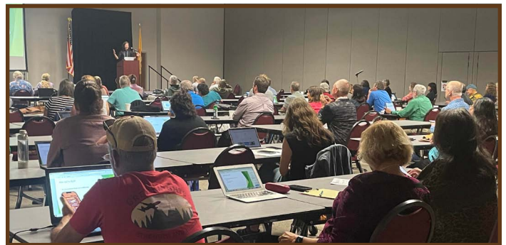
Lecture Hall packed at Ruidoso Summer Conference